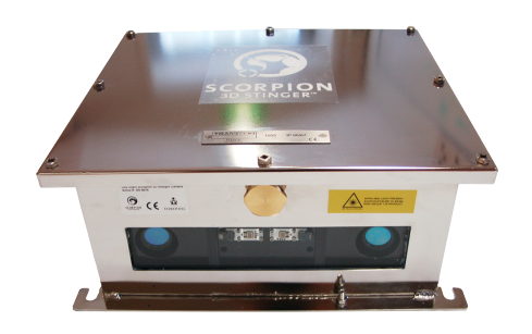
Day Night Scorpion 3D Stinger™ Camera